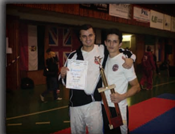
Grand Champion Winner takes 300 EURO CASH