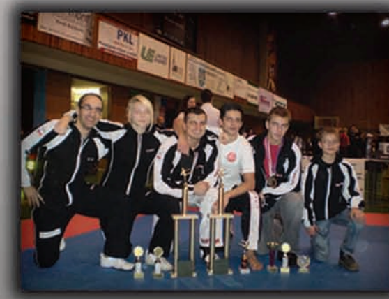
Double team WINNERS take 100 EURO CASH